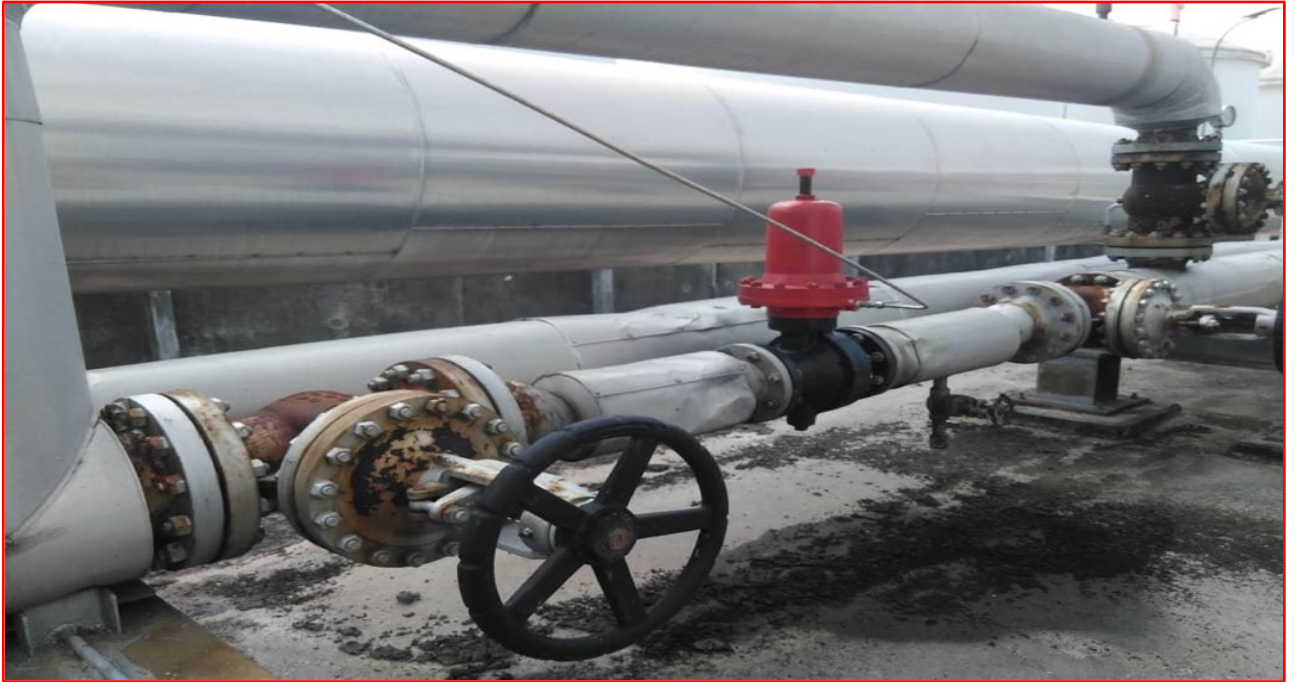
Wet Abrasive Blasting - HOT OIL CORROSION UNDER INSULATION