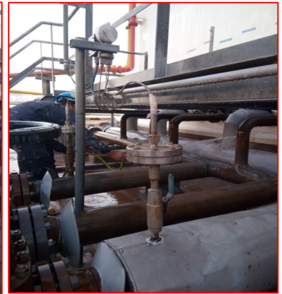
Painting - HOT OIL CORROSION UNDER INSULATION /HIGH TEMPERATURE PAINT